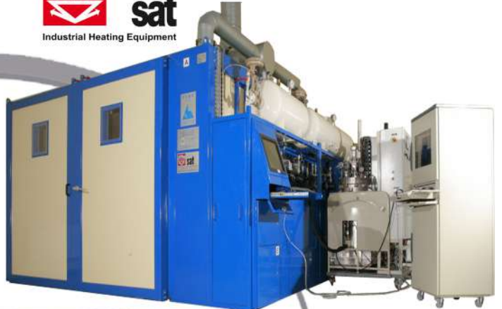
Customized composite curing ovens