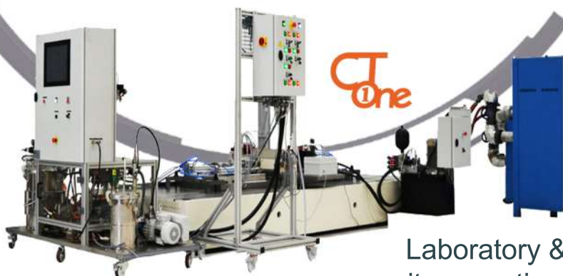
Laboratory & composite expertise