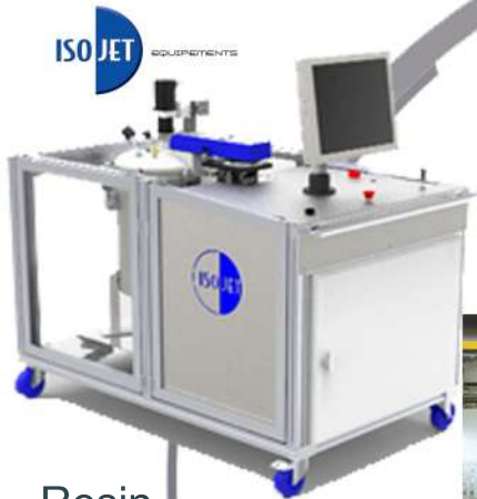
Resin injection machine