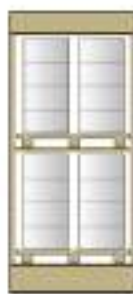
DRUM SAT 2000 H