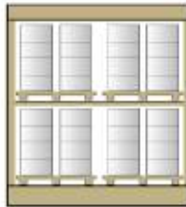
DRUM SAT 4000