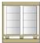
DRUM SAT 1000