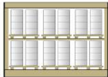
DRUM SAT 6000