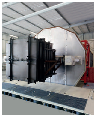
Shuttle rotational molding machine with 2 offset arms "C" - Rotomolding of polyethylene parts - Plastics