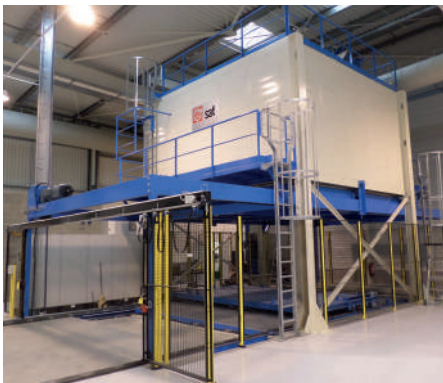
Heat treating furnace - Quenching of aluminum parts – Aeronautics