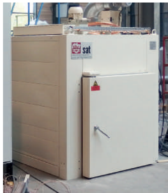
Composite curing oven - Curing of thermosetting parts - Aeronautics